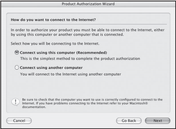
Step 4. Connect to the Internet

In order to obtain the Authorization Code you'll need to go online using an internet connection. In this window, ( Step 4. Connect to Internet )