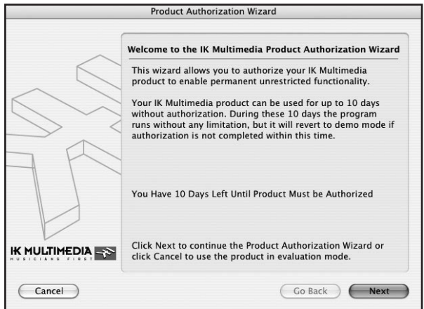
Step 1. Wizard introduction

A built in software Wizard helps you in the authorization of your IK software. The first time the software is launched the Wizard is displayed ( Step 1. Wizard Introduction ). Click Cancel to return to the software and use the software within the 10 days grace period. Click Next to go to the Wizard's next Step and authorize the software.