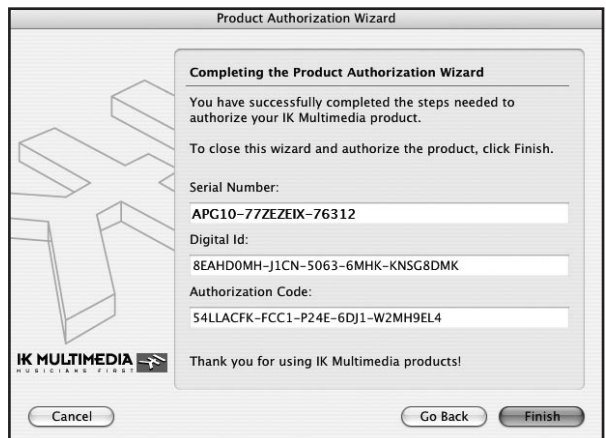
Step 8. Authorization Completed

Once the green icon is displayed, click Next and the last page of the Wizard will appear ( Step 8. Authorization Completed ) listing your Serial Number, Digital ID and Authorization Code as a reference. Click Finish to start using your IK Multimedia product with unrestricted functionality.