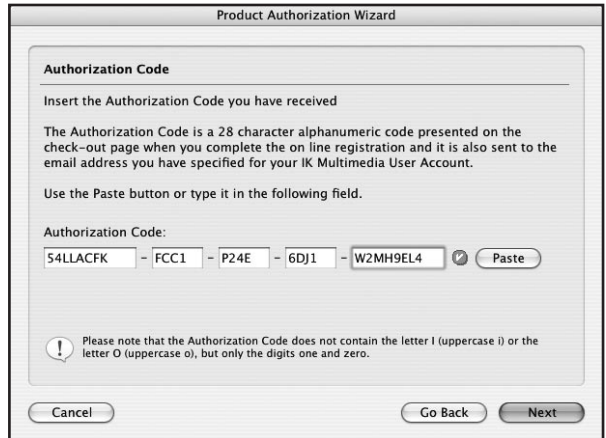
Step 7. Paste Authorization Code

in the first field of the Authorization Code in the Wizard and click on the Paste button. All the separated fields will be filled and a green icon will display, showing the Authorization Code has been entered correctly. If a red icon is displayed, the Serial Number inserted is not correct and you will be asked to re-type it in the fields (if you typed it manually).