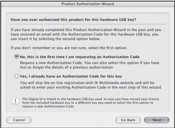
Step 3. Authorization/Reauthorization

properly inserted a green icon will display, showing that the number has been entered correctly. If a red icon is displayed the Serial Number inserted is not correct and you will be asked to re-type it in the fields. Once the Serial Number has been typed correctly, the Next button will enable you to move to the next Step of the Wizard.